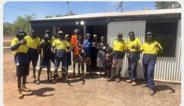
House hand over day in Gäṅgaṅ, early Oct 2025.